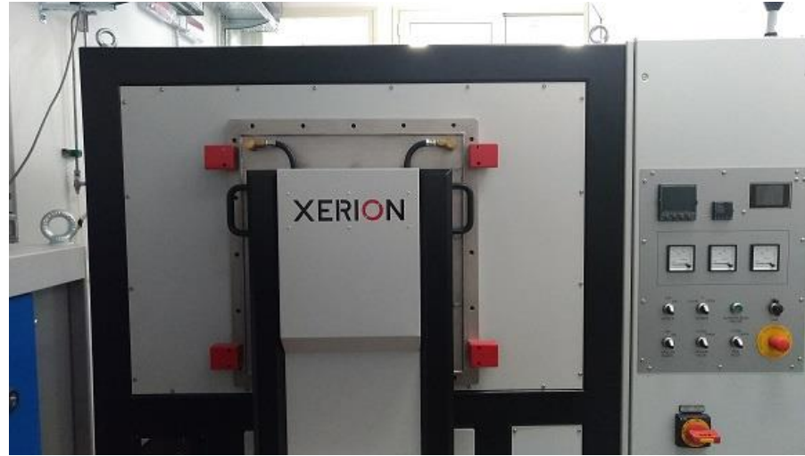
Furnaces for specimens preparation