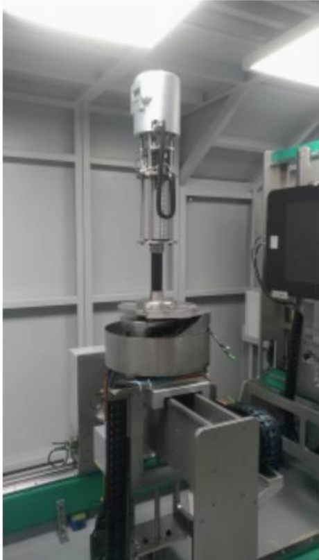
Micro-CT (built up by Fraunhofer IKTS)