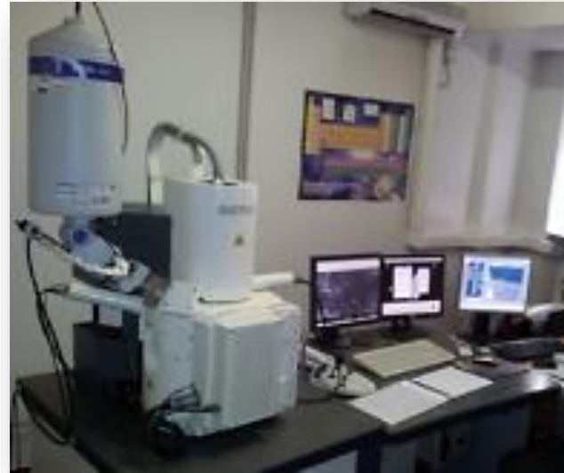
Scanning Electron Microscopy