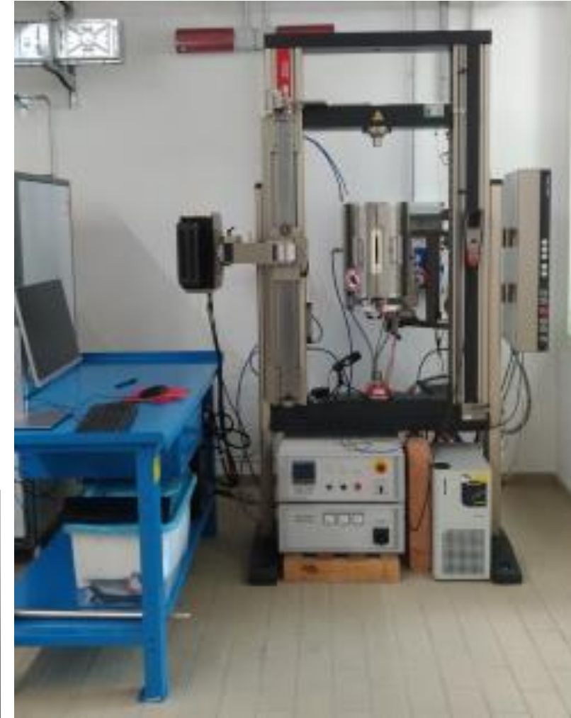
Universal testing machine (Zwick/Roell)