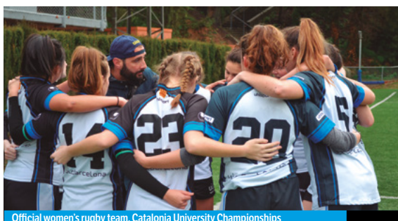
Official women's rugby team. Catalonia University Championships