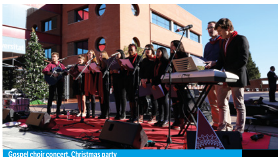
Gospel choir concert. Christmas party

At UIC Barcelona we promote and organise sports activities and competitions, and we provide discounts and special offers to help you access sports facilities to keep you in shape and live healthier lives. Throughout the academic year, we organise charitable activities in cooperation with multiple institutions and advise regarding volunteer work. You can take an active part in #UICSocialDay a day on which the whole University comes together to help those most in need. You can also form part of theatre, debate, painting and music groups, which foster the cultural side of UIC Barcelona and help you acquire more skills and values.